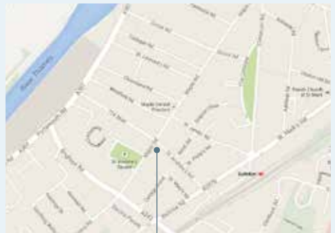
St Andrew's Church

The church is highly accessible, close to Surbiton railway station and bus routes (71, 281, 465, K1, K2, K3, K4), and with good provision for eating and drinking close by. In addition to on-street parking, there are car parks nearby at Waitrose, Sainsbury's, and St Philip's Road.