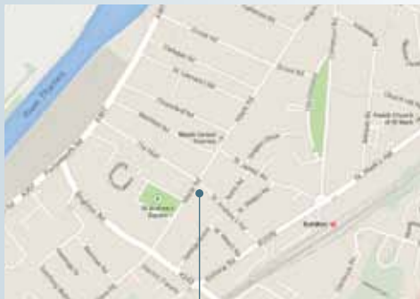
St Andrew's Church

The church is highly accessible, close to Surbiton railway station and bus routes (71, 281, 465, K1, K2, K3, K4), and with good provision for eating and drinking close by. In addition to on-street parking, there are car parks nearby at Waitrose, Sainsbury's, and St Philip's Road.